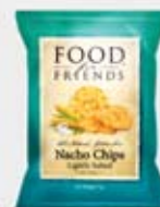
Food for Friends Nacho Chips 70g