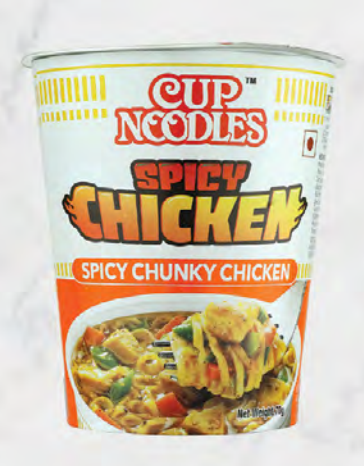
NISSIN SPICY CHICKEN