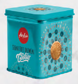
SUGAR FREE OATMEAL COOKIES ₹100