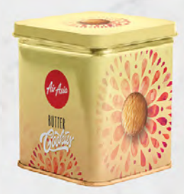
BUTTER COOKIES ₹100