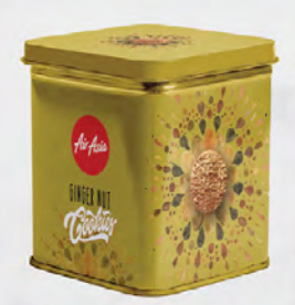
GINGER NUT COOKIES ₹100