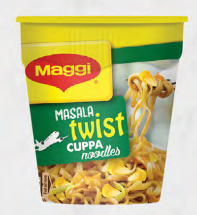
MAGGI MASALA TWIST