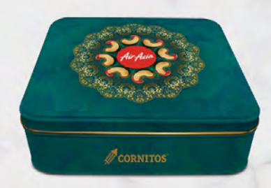
LIGHTLY SALTED ROASTED CASHEWS ₹150