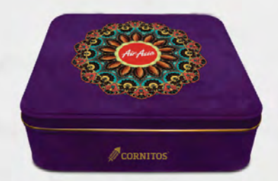
HONEY ROASTED ALMONDS ₹150